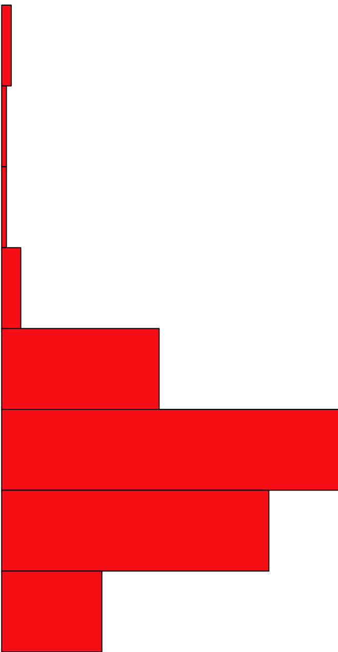
Histogram of x